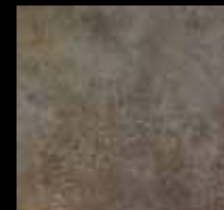
6.5" x 6.5"