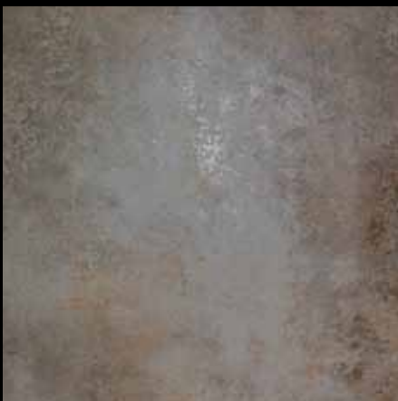
20" x 20"