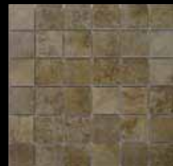
2" x 2" mosaic sheet