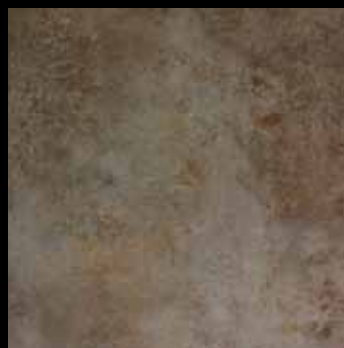
13" x 13"